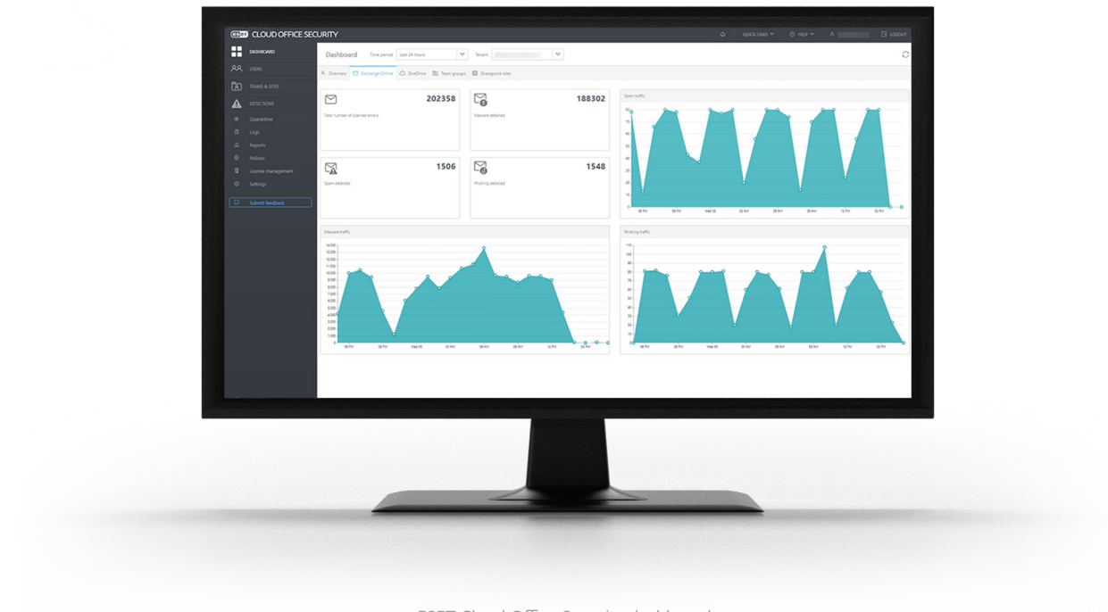
ESET Cloud Office Security dashboard